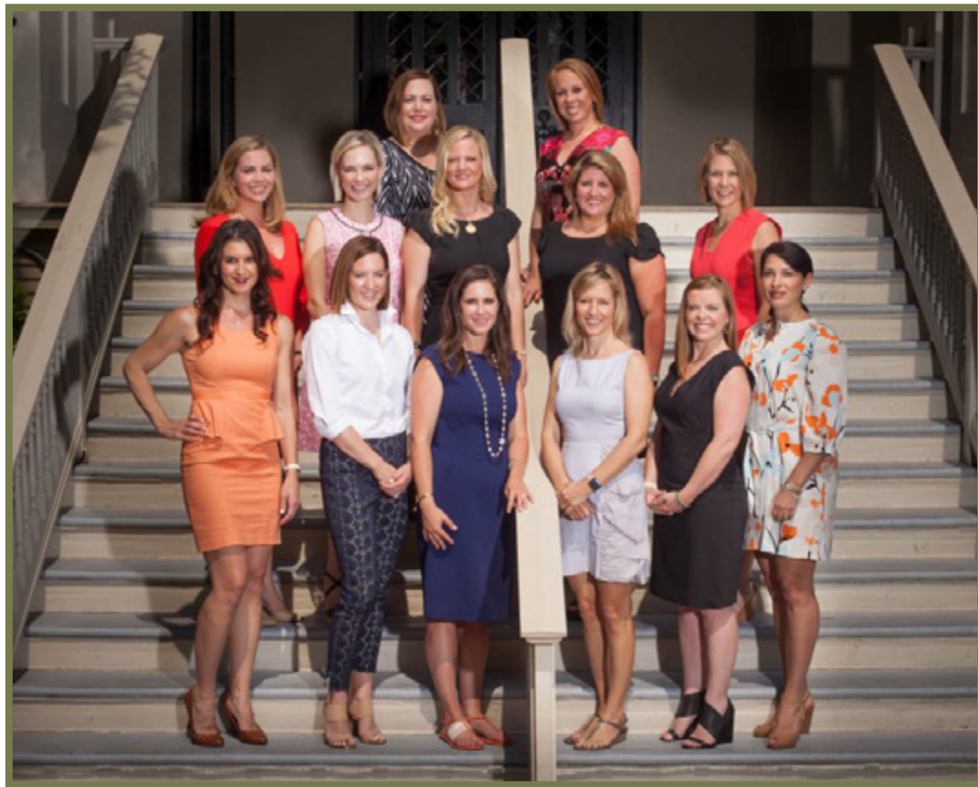
Texas Biomedical Forum New Board Trustees for 2016-2017

In April, 2016, fourteen ladies were slated and elected as New Trustees for the Texas Biomedical Forum. These ladies attended their orientation luncheon at The Argyle in May, 2016. Each of these ladies express a true passion for the Forum and all that it stands for within our community. We would love your help in welcoming them as they begin the newest chapter in their daily role as a New Trustee for the Forum.