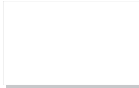
Step 9 Observations ( with dye )