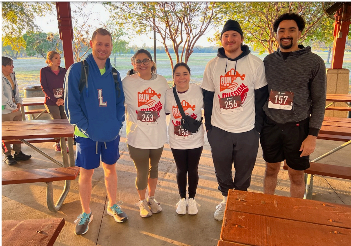
IN-TRAC participants partake in the Texas Center for Infectious Disease (TCID) Run/Walk on Saturday, November 16, 2024. #RaceToEndTB

Congress must help end tuberculosis, which still kills millions worldwide: San Antonio Express News Article